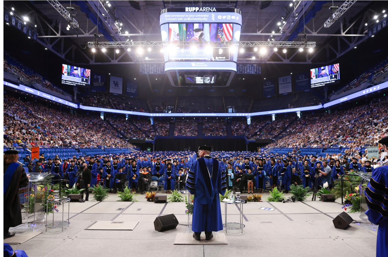
One of four commencement ceremonies to celebrate more than 4,000 graduates in May 2023.