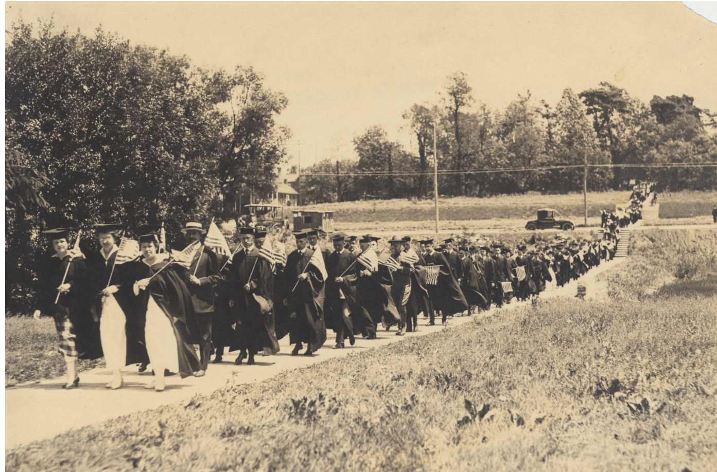
As part of the 1917 commencement celebration, 315 graduates with flags cross Limestone Street.